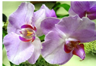
Dtps - Taiwan Red Cat (R. Kimura) - Category 4