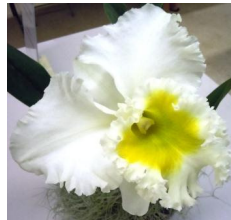
B/C White Diamond 'Kouchi' (Deanna Hayashida - category 2)