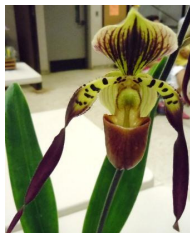
Paph Berenice x Angel Hair (Wilbur) - Category 3