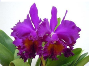
Blc Murray Spencer 'AM Roy's Dark Star' (Shirley Tang - Category 3)