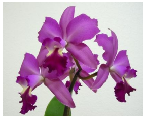
Lc Wine Festival x Hawaiian Wedding Song (Deanna Hayashida - Category 2)