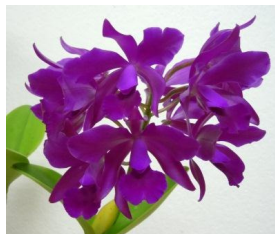
Bactia 'Grape Wax' (Jean Oki - Category 4)