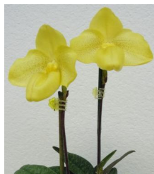
Paph Hsinying Agogo (Shirley Tang - Category 3)