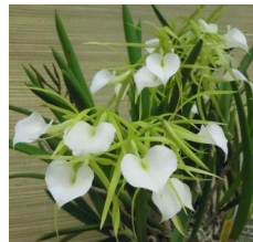
B Little Stars B nodosa x B Cordata (Paula Wheeler - Category 4)