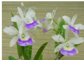
Blc Hawaii Stars "Hsinying" (Alice Kim - Category 2)