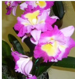
Otaara Hwa Yuan Bay 'She Shu' AM/OSROC (Gayle Ozawa) - Category 4