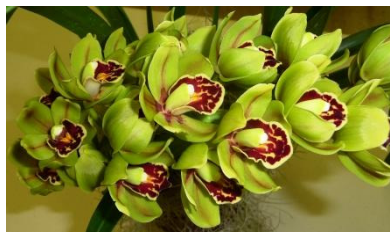
Cyn. Sunshine Fall 'Butterhall' (Deanna Hayashida) - Category 2