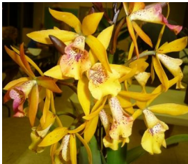
Roth. Koolau Starbright 'Elizabeth' (Michiko Suzuki) - Category 1

Category 4: Members growing orchids for From KOS functions