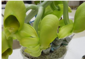
CTSM Orchidglade (Dave Steele - Category 2)