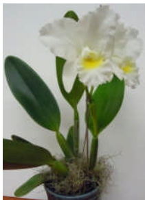
C. Angel Bells (Beaudine Ma - Category 1)

American Orchid Society Judging. We have four categories for culture awards: