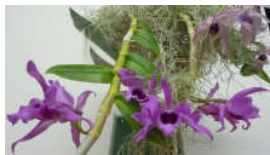
Den Nestor "Stripe" x parishii semi - alba (Deenie Kimura - Category 4)