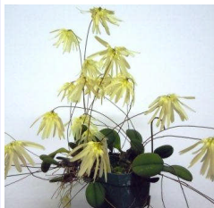
Bulb Comingii (Wilbur Chang - Category 3)