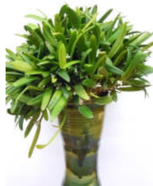
Cordatla Taylori (Deanna Hayashida - Category 2)