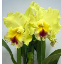
B/C Goldenzelle 'Lemon Chiffon' (Deanna Hayashida - Category 2)