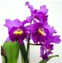
Pot. Hsinying Pink Doll B/C Little Marmaid x Pot. Li Jivan Danier (Noname—Category 1)

American Orchid Society Judging. We have four categories for culture awards: