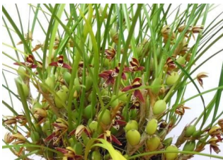
Maxillaria Tenuifolia 'Compact' (Wilbur - Category 3)