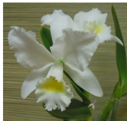
C. Angel Bell "Suzie" AM/AOS (Beaudine Ma - Category 4)