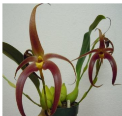
Blub Jersey "Elizabeth" (Wilbur Chang - Category 3)