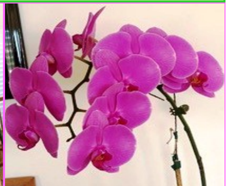
Three views of a fine phalaenopsis specimen, noname. Submitted by Shelly Miyahara