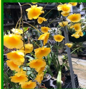
d. Aggregatum (Michele)