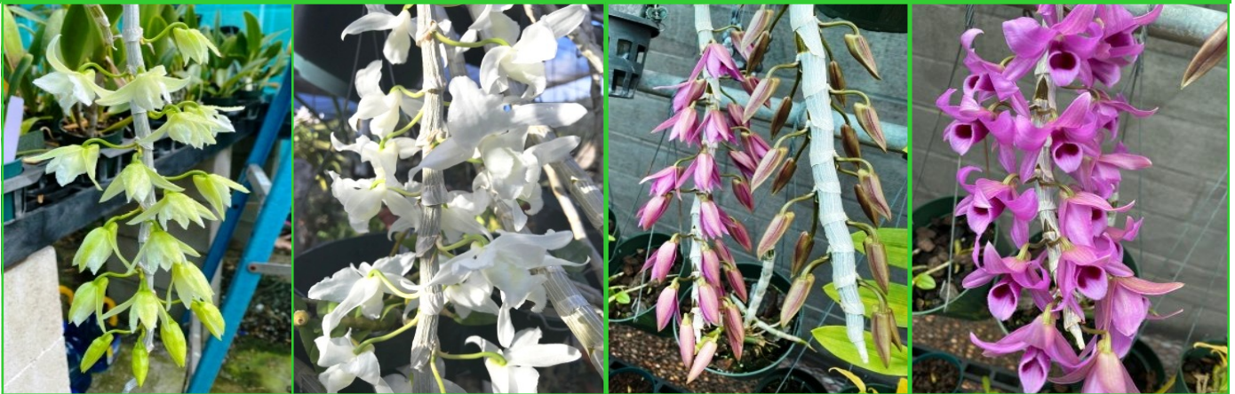
Honohono Arriving (Above) Orchid Medley (Below) - D. maiki, a prolific dendrobium, Rth. Fuchs Orange Nugget, D. Jaquelyn Thomas 'Uniwai Pearl',